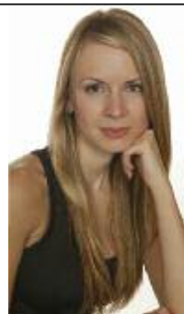
Medium Blonde Mix

#14 & 18 - Vision Select #DB3 & DB4 - Euro So.Cap.