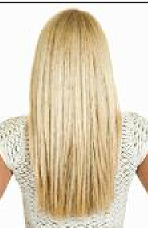
Light Blonde Mix

#14, 18/22 & 613 - Vision Select #DB4 & DB2 & 1001 - Euro So.Cap.