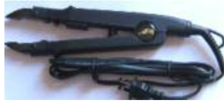
Economy Extension Iron Good budget iron, will apply all fusion extensions that Vision sells. Adjustable temperature.