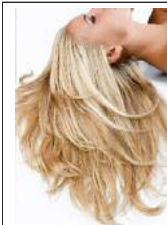
California Blonde Mix

#14, 18/22 & 613 - Vision Select #DB4 & DB2 & 1001 - Euro So.Cap.