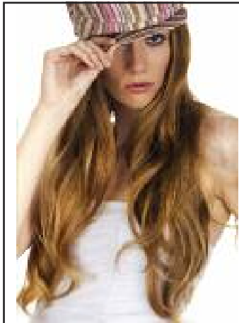
Strawberry Blonde Mix