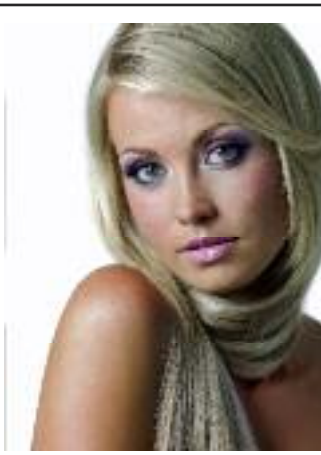
Very Ash Blonde

#60 or 613 - Vision Select #1001 - Euro So.Cap.