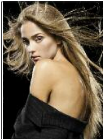
Light Ash Brown