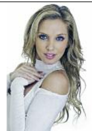
Cool Highlight Blonde

#8 & 4 - Vision Select #10 & 8 - Euro So.Cap.