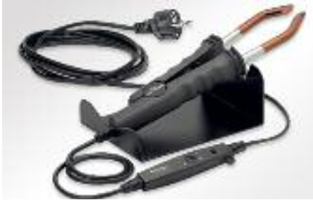
Professional Euro SoCap Fusion Iron includes metal stand Made in Italy. Professional quality, adjustable temperature. Our highest quality iron.